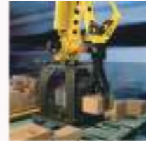
Automation production line